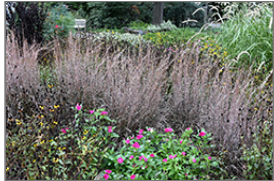
Standing Ovation Bluestem in fall

Standing Ovation Bluestem is recommended for the following landscape applications;