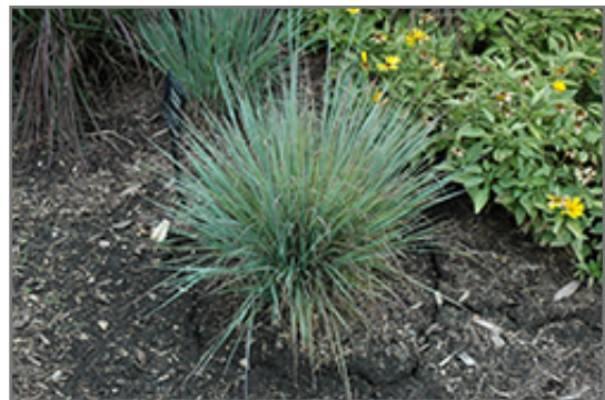
Standing Ovation Bluestem

North Hanley 4215 North Hanley Road St. Louis, MO 63121 (314) 428.9878