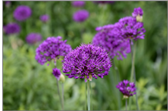
Purple Sensation Ornamental Onion flowers

Purple Sensation Ornamental Onion is an open herbaceous perennial with tall flower stalks held atop a low mound of foliage. Its relatively coarse texture can be used to stand it apart from other garden plants with finer foliage.