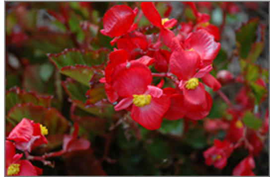
BabyWing Red Begonia flowers

BabyWing Red Begonia is a fine choice for the garden, but it is also a good selection for planting in outdoor containers and hanging baskets. It is often used as a 'filler' in the 'spiller-thriller-filler' container combination, providing a mass of flowers and foliage against which the thriller plants stand out. Note that when growing plants in outdoor containers and baskets, they may require more frequent waterings than they would in the yard or garden.