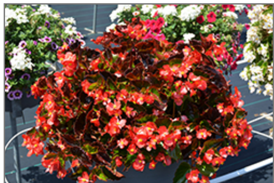
BabyWing Red Begonia in bloom