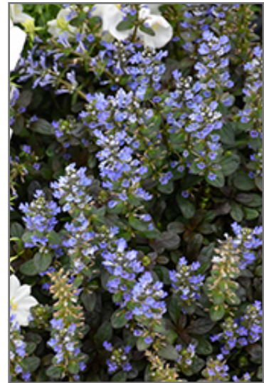
Chocolate Chip Bugleweed flowers

Chocolate Chip Bugleweed is recommended for the following landscape applications;