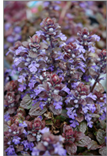
Bronze Beauty Bugleweed flowers