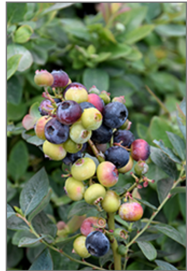
Pink Icing Blueberry fruit

Pink Icing Blueberry features dainty clusters of white bell-shaped flowers with shell pink overtones hanging below the branches in mid spring, which emerge from distinctive pink flower buds. It has bluish-green deciduous foliage which emerges pink in spring. The glossy oval leaves turn an outstanding aqua bluish-green in the fall. It features an abundance of magnificent blue berries in mid summer.