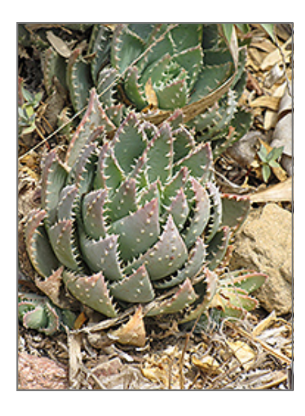
Short-leaved Aloe

Short-leaved Aloe is recommended for the following landscape applications;