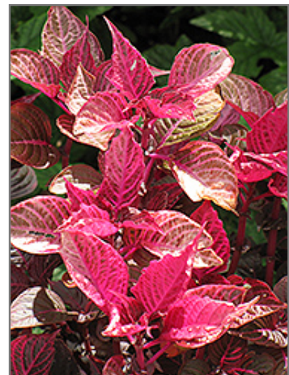
Linden's Blood Leaf foliage

North Hanley 4215 North Hanley Road St. Louis, MO 63121 (314) 428.9878