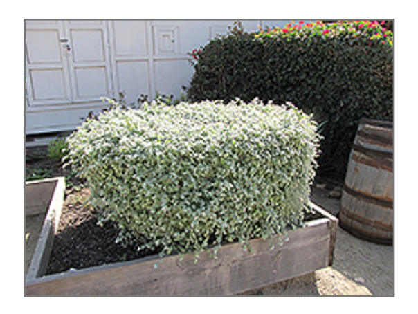
Licorice Plant

Licorice Plant is recommended for the following landscape applications;