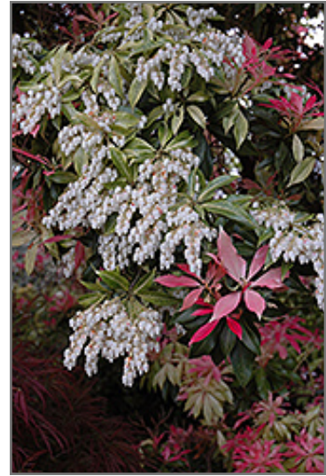
Valley Fire Japanese Pieris flowers

Valley Fire Japanese Pieris is recommended for the following landscape applications;