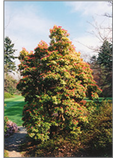
Valley Fire Japanese Pieris

This shrub does best in full sun to partial shade. It requires an evenly moist well-drained soil for optimal growth, but will die in standing water. It is very fussy about its soil conditions and must have rich, acidic soils to ensure success, and is subject to chlorosis (yellowing) of the foliage in alkaline soils. It is somewhat tolerant of urban pollution, and will benefit from being planted in a relatively sheltered location. Consider applying a thick mulch around the root zone in winter to protect it in exposed locations or colder microclimates. This is a selected variety of a species not originally from North America, and parts of it are known to be toxic to humans and animals, so care should be exercised in planting it around children and pets.