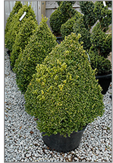
Green Mountain Boxwood (pyramid form)

Green Mountain Boxwood (pyramid form) will grow to be about 3 feet tall at maturity, with a spread of 3 feet. It tends to fill out right to the ground and therefore doesn't necessarily require facer plants in front. It grows at a slow rate, and under ideal conditions can be expected to live for approximately 30 years.