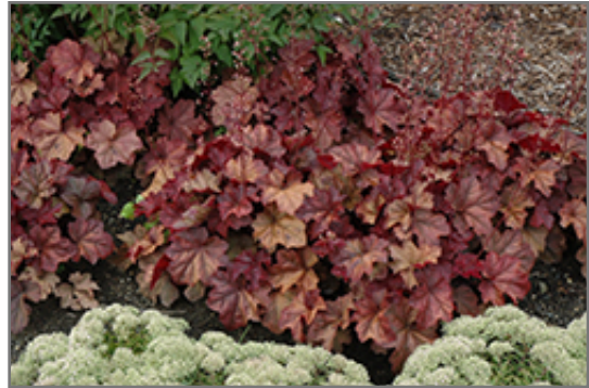
Lava Lamp Coral Bells

Lava Lamp Coral Bells will grow to be about 16 inches tall at maturity extending to 32 inches tall with the flowers, with a spread of 28 inches. When grown in masses or used as a bedding plant, individual plants should be spaced approximately 24 inches apart. Its foliage tends to remain dense right to the ground, not requiring facer plants in front. It grows at a medium rate, and under ideal conditions can be expected to live for approximately 10 years. As an evergreen perennial, this plant will typically keep its form and foliage year-round.