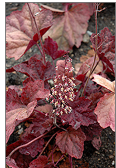
Lava Lamp Coral Bells flowers

North Hanley 4215 North Hanley Road St. Louis, MO 63121 (314) 428.9878