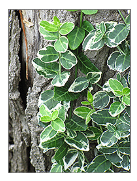
Emerald Gaiety Wintercreeper foliage

Emerald Gaiety Wintercreeper is recommended for the following landscape applications;