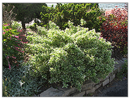
Emerald Gaiety Wintercreeper