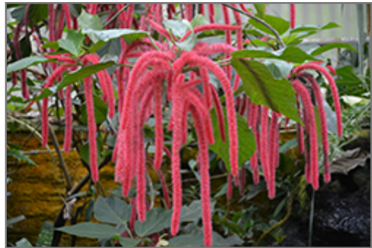
Firetail Chenille Plant flowers