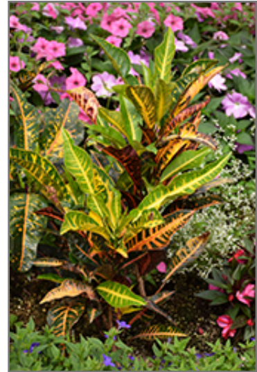
Variegated Croton