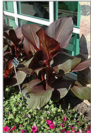
Tropicanna Black Canna

This plant is native to the tropics and prefers growing in moist environments with evenly warm conditions all year round. In our climate, it is usually grown as an outdoor annual in the garden or in a container. If you want it to survive the winter, it can be brought in to the house and provided with special care, and then returned to the garden the following season. In its preferred tropical habitat, it can grow to be around 5 feet tall at maturity, with a spread of 24 inches. However, when grown as an annual or when overwintered indoors, it can be expected to perform differently, and its exact height and spread will depend on many factors; you may wish to consult with our experts as to how it might perform in your specific application and growing conditions.