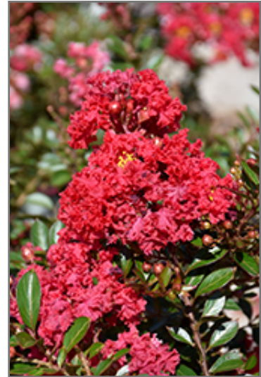
Cherry Dazzle Crapemyrtle flowers

Cherry Dazzle Crapemyrtle is recommended for the following landscape applications;