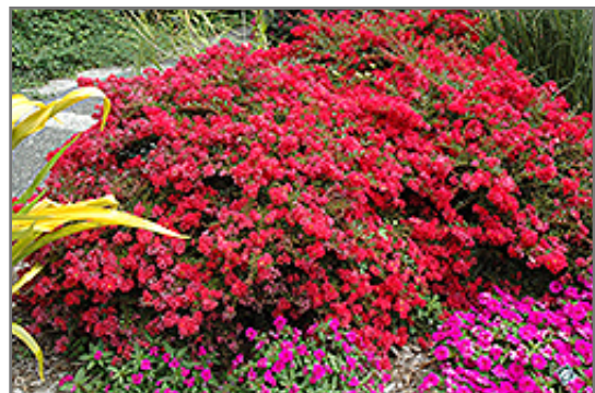
Cherry Dazzle Crapemyrtle in bloom

North Hanley 4215 North Hanley Road St. Louis, MO 63121 (314) 428.9878