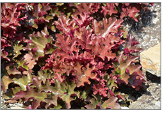
Dolce Cinnamon Curls Coral Bells foliage

St. Charles 3200 Greens Bottom Road St. Charles, MO 63304 (636) 447.2230