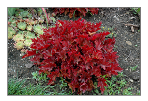
Dolce Cinnamon Curls Coral Bells