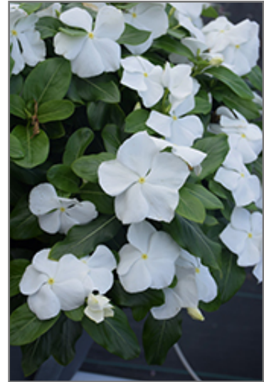
Titan Pure White Vinca flowers

Titan Pure White Vinca is recommended for the following landscape applications;