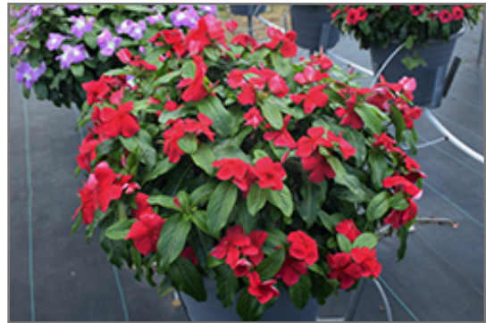
Titan Dark Red Vinca in bloom

Titan Dark Red Vinca will grow to be about 14 inches tall at maturity, with a spread of 12 inches. Its foliage tends to remain dense right to the ground, not requiring facer plants in front. Although it's not a true annual, this fast-growing plant can be expected to behave as an annual in our climate if left outdoors over the winter, usually needing replacement the following year. As such, gardeners should take into consideration that it will perform differently than it would in its native habitat.