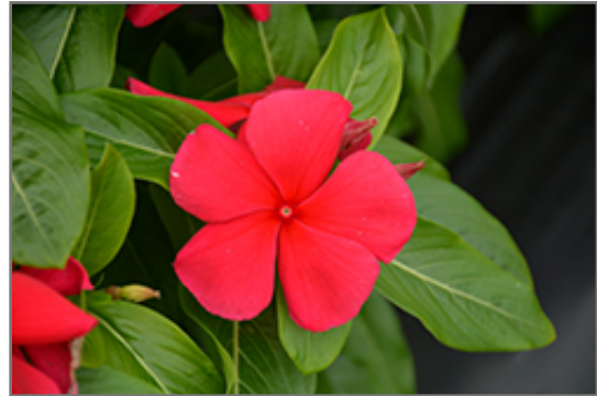
Titan Dark Red Vinca flowers

Titan Dark Red Vinca is recommended for the following landscape applications;