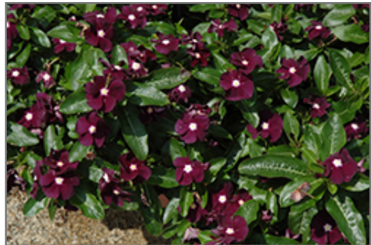
Jams 'N Jellies Blackberry Vinca flowers

Jams 'N Jellies Blackberry Vinca is recommended for the following landscape applications;