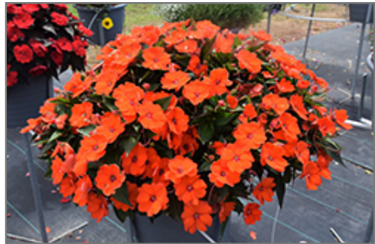
SunPatiens Compact Electric Orange New Guinea Impatiens in bloom

SunPatiens Compact Electric Orange New Guinea Impatiens is a fine choice for the garden, but it is also a good selection for planting in outdoor containers and hanging baskets. It can be used either as 'filler' or as a 'thriller' in the 'spiller-thriller-filler' container combination, depending on the height and form of the other plants used in the container planting. It is even sizeable enough that it can be grown alone in a suitable container. Note that when growing plants in outdoor containers and baskets, they may require more frequent waterings than they would in the yard or garden.