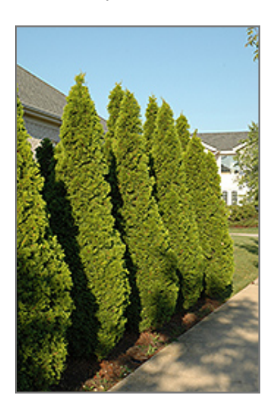
Emerald Green Arborvitae