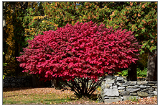
Winged Burning Bush in fall

Winged Burning Bush is recommended for the following landscape applications;