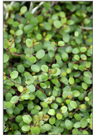
Creeping Wire Vine foliage