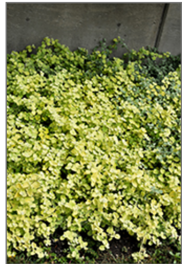
Lemon Licorice Plant

North Hanley 4215 North Hanley Road St. Louis, MO 63121 (314) 428.9878