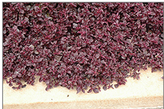
Purple Lady Blood Leaf