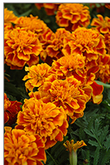
Bonanza Flame Marigold flowers

North Hanley 4215 North Hanley Road St. Louis, MO 63121 (314) 428.9878