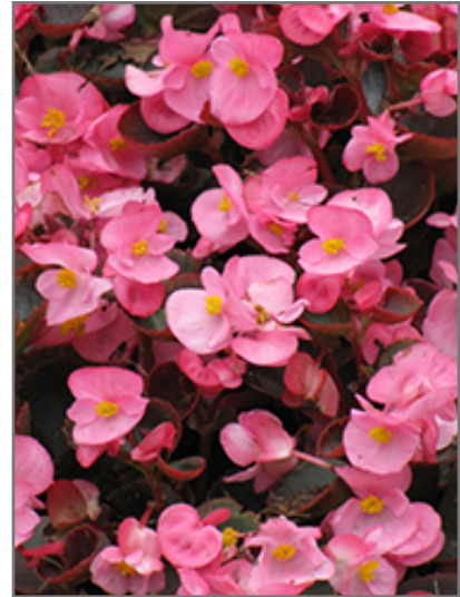
Bada Boom Pink Begonia flowers