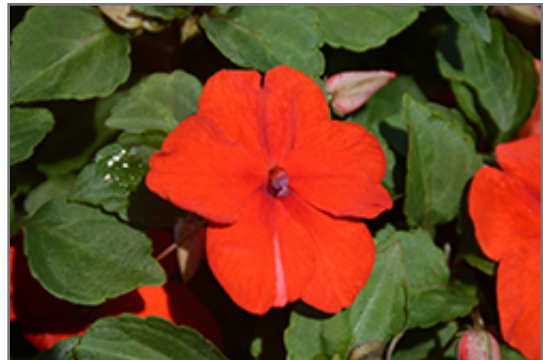
Super Elfin XP Scarlet Impatiens flowers

Super Elfin XP Scarlet Impatiens is recommended for the following landscape applications;