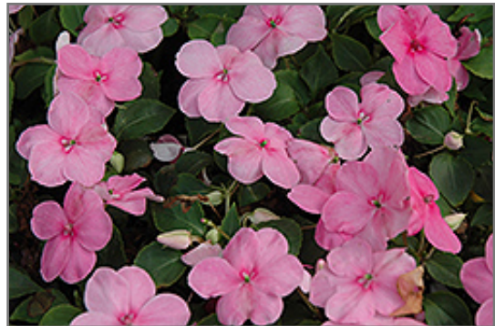
Super Elfin XP Pink Impatiens flowers