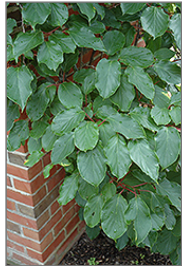
Weiki Hardy Kiwi foliage