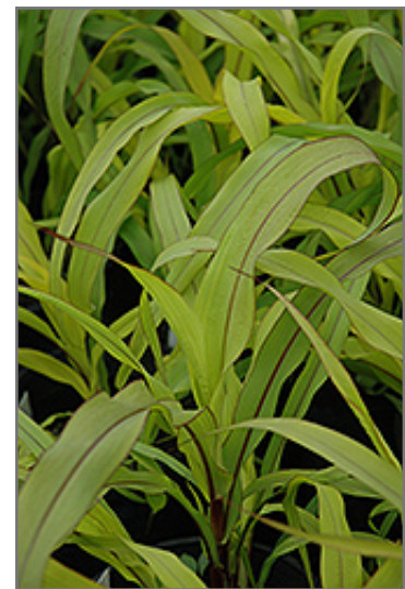
Jester Millet foliage

North Hanley 4215 North Hanley Road St. Louis, MO 63121 (314) 428.9878