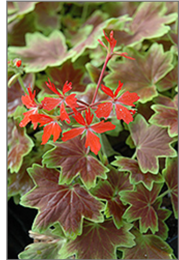
Vancouver Centennial Geranium flowers