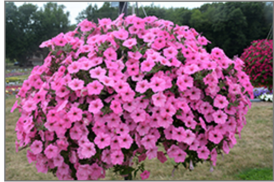
Supertunia Vista Bubblegum Petunia in bloom

Supertunia Vista Bubblegum Petunia will grow to be about 18 inches tall at maturity, with a spread of 24 inches. When grown in masses or used as a bedding plant, individual plants should be spaced approximately 20 inches apart. Its foliage tends to remain dense right to the ground, not requiring facer plants in front. This fast-growing annual will normally live for one full growing season, needing replacement the following year.