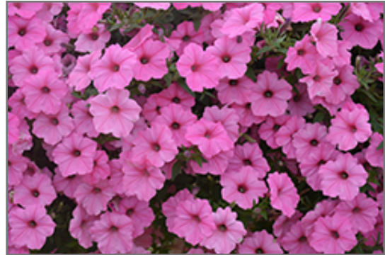
Supertunia Vista Bubblegum Petunia flowers

Supertunia Vista Bubblegum Petunia is recommended for the following landscape applications;