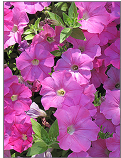
Easy Wave Pink Petunia flowers

Easy Wave Pink Petunia is a dense herbaceous annual with a trailing habit of growth, eventually spilling over the edges of hanging baskets and containers. Its medium texture blends into the garden, but can always be balanced by a couple of finer or coarser plants for an effective composition.