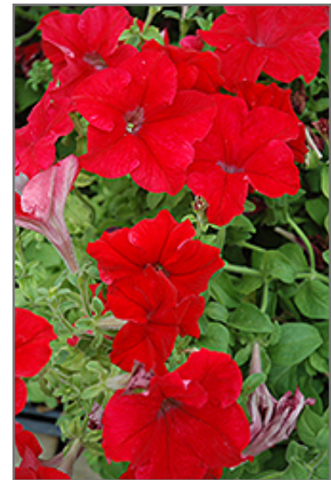
Dreams Red Petunia flowers

North Hanley 4215 North Hanley Road St. Louis, MO 63121 (314) 428.9878