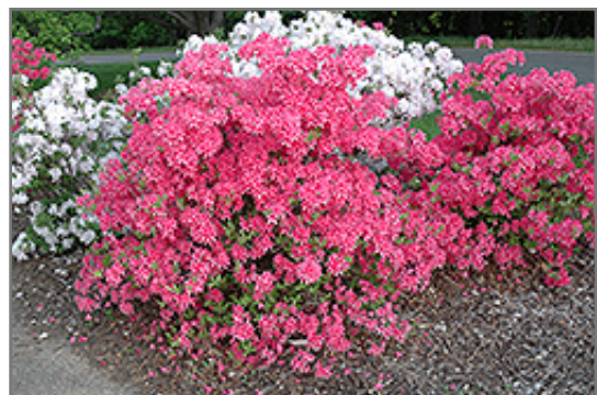
Rosy Lights Azalea in bloom

North Hanley 4215 North Hanley Road St. Louis, MO 63121 (314) 428.9878