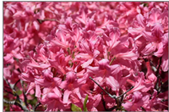
Rosy Lights Azalea flowers

Rosy Lights Azalea is recommended for the following landscape applications;