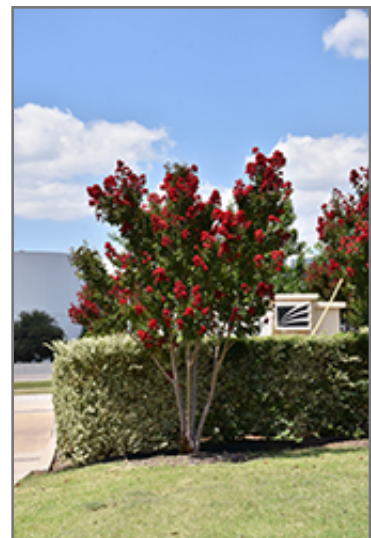
Dynamite Crapemyrtle in bloom

North Hanley 4215 North Hanley Road St. Louis, MO 63121 (314) 428.9878