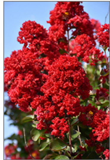
Dynamite Crapemyrtle flowers