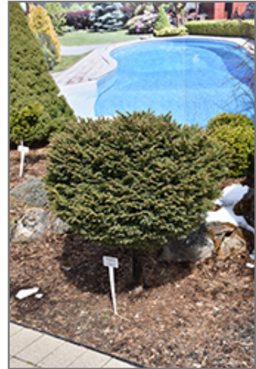
Little Gem Spruce (tree form)