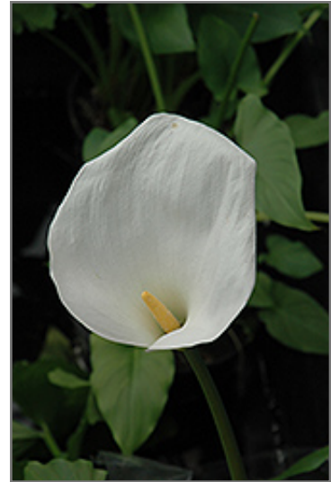
Calla Lily flowers

Calla Lily is recommended for the following landscape applications;