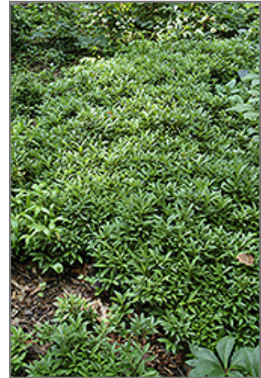
Dwarf Sweet Box

Dwarf Sweet Box is recommended for the following landscape applications;